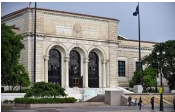
The Detroit Institute of Arts.

Along with raising money, the DIA has pledge to stage exhibitions and hold educational programs across the state.